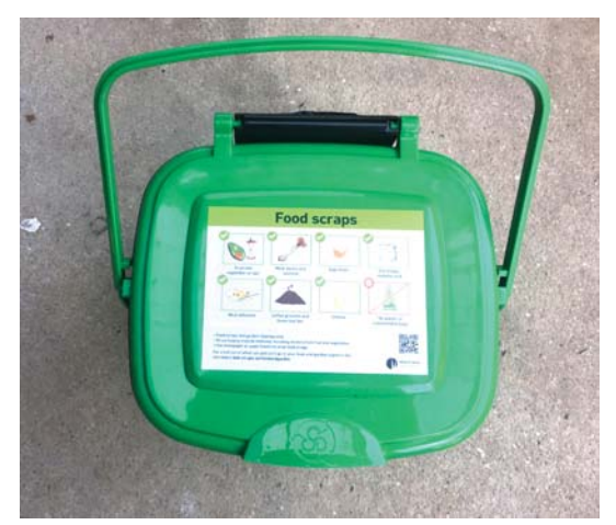
Food Scrap Bin for the Kitchen -Free from Council

Welcome to this new feature on our environment from members of the Climate Change - Living Well & Sustainably Program. Recently we've spent time trying to understand the ins and outs of recycling.